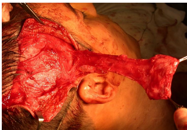
Figure 6: The rib cartilage graft prefabricated within the temporoparietal fascia is preparing to transfer. (Patient 2, intraoperative view).