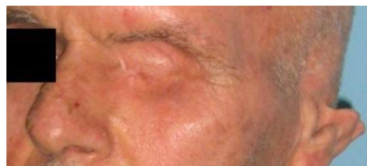
Figure 4: Orbital reconstruction was performed with a left TPF and split-thickness skin graft. The amputation of the upper half of the left ear is not associated with this situation (Patient 1, postoperative oblique view).