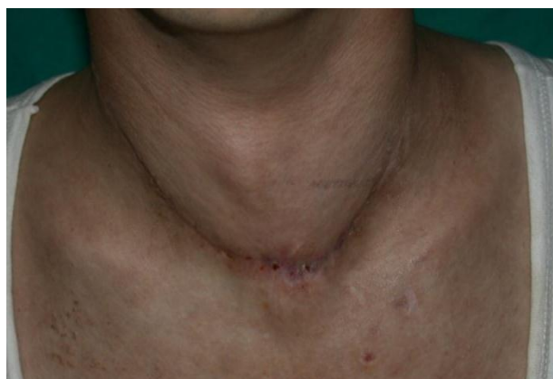
Figure 7: Postoperative view of the patient (Patient 2).