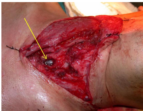
Figure 5: An 18-year old male with 2x2 cm of laryngeal defect due to prolonged intubation. The arrow shows the defect and the intubation tube (Patient 2, intraoperative view).

An 18-year old male admitted to an Emergency Department due to a car crash accident. He was followed-up in an Intensive Care Unit, requiring prolonged intubation. The cuff of the intubation tube resulted with necrosis at the central part of the larynx. Ear Nose Throat surgeons attempted to reconstruct the defect with local flaps which ended up with failure. He was referred to our clinic for the reconstruction of the 2x2 cm of laryngeal defect (Figure 5). The major complaints were dysphonia, dyspnea, and wheezing. We have planned a two-stage reconstruction. At the first stage, rib cartilage graft was prefabricated within the TPF. Two weeks later, the microvascular transfer of the free TPF was performed (Figure 6). The superior thyroid artery and vein were used as the recipient vessels. The patient was satisfied from the outcome of the surgery and at the seven years' follow-up he had no complaints about dysphonia or breathing problems (Figure 7).