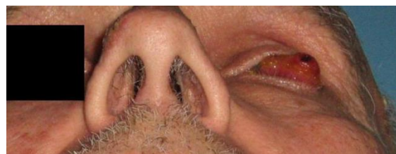
Figure 3: Preoperative basal view of the same patient (Patient 1).