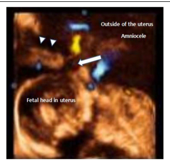
Fig. 2. Transabdominal 3D US. Through the focal defect in the uterus, the umbilical arteries and veins were colorized by 3D doppler sonography. The umbilical cord appears as a long, extended, tubular structure. The anterior aspect of the fetal head was abutting the umbilical cord and the rupture site and umbilical cord closely. arrow: ruptured site of the uterus; arrow head: intact uterus wall.