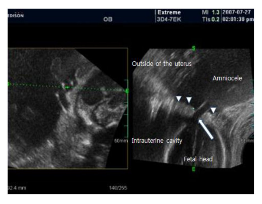
Fig. 1. 3D transabdominal ultrasound finding. About 15 X 15cm sized large cystic mass was noted outside of the uterus. The cyst was an amniotic sac protruding through the ruptured site of the uterus; below the site, the fetal head was seen in the uterus cavity. arrow: ruptured site of the uterus; arrow head: intact uterus wall.

otic sac containing the fetus protruded through a 4 cm ruptured left fundal uterine wall and about 1000 mL hemoperitoneum was detected (Fig. 3). The fetus was delivery by Cesarean section using a classic uterine incision. The fetus expired (male, 700 g) immediately after delivery. Amniotic fluid was clear and not odorful. After removal of the placenta, a double layer of 2-0 chromic was used to close the uterine defect. The patient was discharged 5 days later.