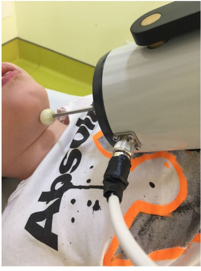
Fig. I shows the transducer position during drooling treatment in a patient with cerebral palsy.

After having wiped off the saliva from the chin and any trace of food that had remained in the mouth was taken away too, the drooling quotient assessment started. DQ was recorded, registering the episodes of drooling that took place during two stages of 5 minutes that were separated by an interval of 30 minutes [22]. When new saliva appeared on the lip margin or drooling started from the chin, it was considered as an episode of drooling. Every 15 seconds, for 5 minutes (totally 20 assessments) there was a control to verify if drooling was occurring or not. During the DQ 'rest' condition, the child could watch TV, sit in an upright position on his wheelchair, but he did not have to talk. In the DQ "activity" condition, according to the child's interests and his abilities they could perform different activities such as using electronic communication devices or play building blocks.