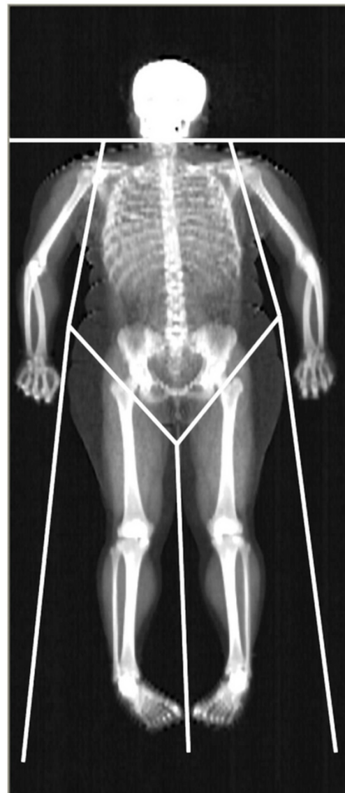
Figure 1. Representative whole-body DXA scan. The limits defining the regions of interest used in this work (upper and lower limb, trunk) are depicted.

Body circumferences (BCs) are simple to measure, inexpensive and non-invasive, and require minimum instrumentation (just an anthropometry tape) while yielding accurate data when performed by a trained operator according to standard procedures [15]. Moreover, BCs can easily be used in field studies as well as the clinical setting. In addition to the ease of measurement, BCs have fewer problems with measurement error vs. skinfold thickness, especially in persons with obesity [16].