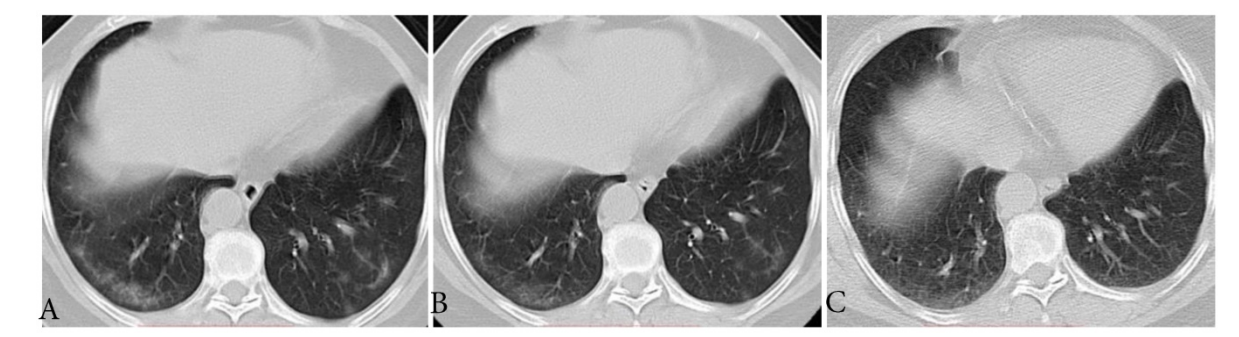
Figure 1. Typical evolution of type-GI in a 61-year-old female with asymptomatic SARS-CoV-2 infection. A, Day 0, the first chest CT showed multifocal lesions of subpleural GGO in bilateral lower lobe. B, Day 3, obvious resolution of the first GGO was observed. C, Day 6, continued resolution with minimal residual GGO was observed, the patient had two consecutive negative results of RT-PCR (day 6 and 7). GGO, ground-glass opacity; GI, gradual improvement; SARS-CoV-2, severe acute respiratory syndrome coronavirus 2.

On the last CT scans, two individuals had complete resolution of lung abnormalities, and the other 16 individuals had residual lesions including GGO (88.9%) and linear opacities (22.2%). The percentage of consolidation showed a decrease on the first CT to last CT, and the difference was statistically significant (p = 0.031). The median long diameter and density of the max lesion on the last CT were 1.7cm and -701.9HU, respectively, which were statistically smaller than those of the first CT ( Table 2 ).